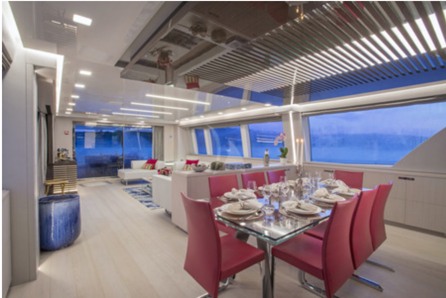
Main Salon Dining