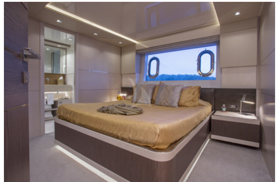
Queen Guest Stateroom