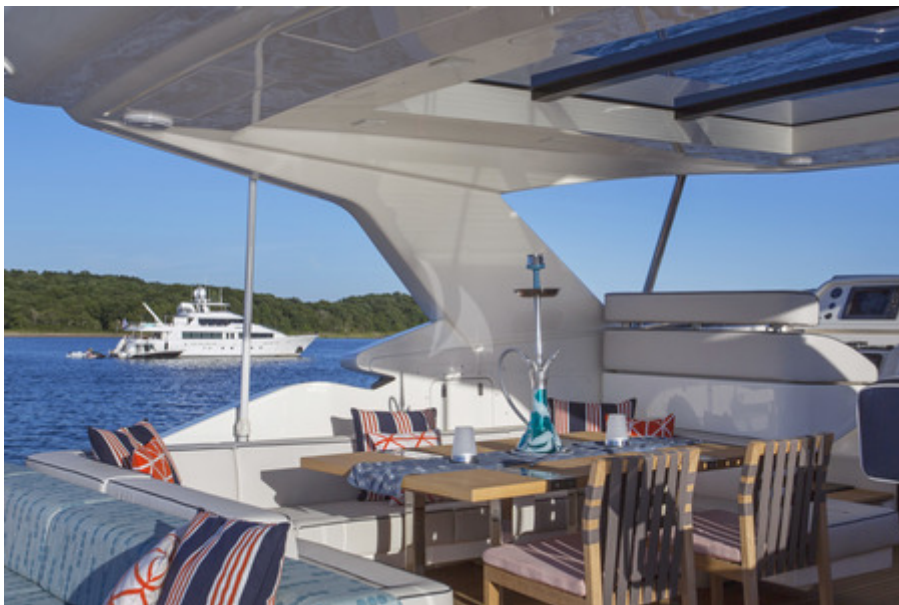
Flybridge Dining Table