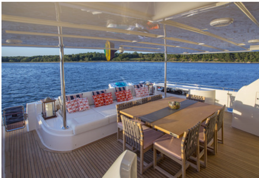
Main Aft Deck