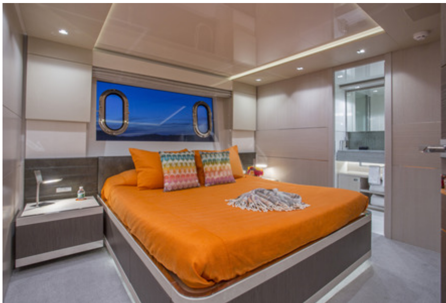
Queen Guest Stateroom