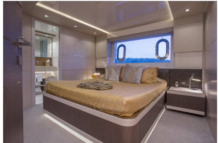
Queen Guest Stateroom